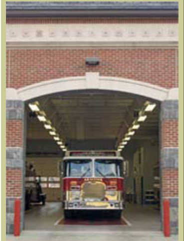
Architect-of-Record: Mitchell-Ross Associates Architects, P.C.