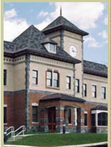
Architect-of-Record: Mitchell-Ross Associates Architects, P.C.